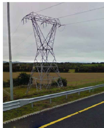
Indicative photo of similar tower on the M9 in County Kilkenny (NTS)